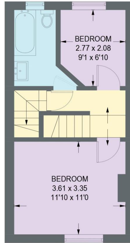
FIRST FLOOR 29.2 SQ M / 314 SQ FT