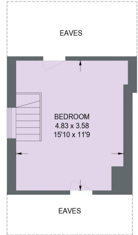
SECOND FLOOR 17.6 SQ M / 189 SQ FT (EXCLUDING EAVES)

Illustration for identification purposes only, measurements are approximate, not to scale.