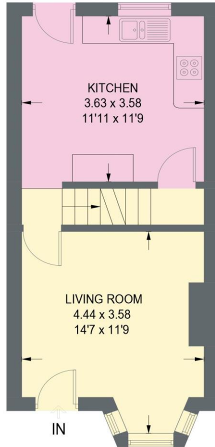
GROUND FLOOR 31.4 SQ M / 338 SQ FT